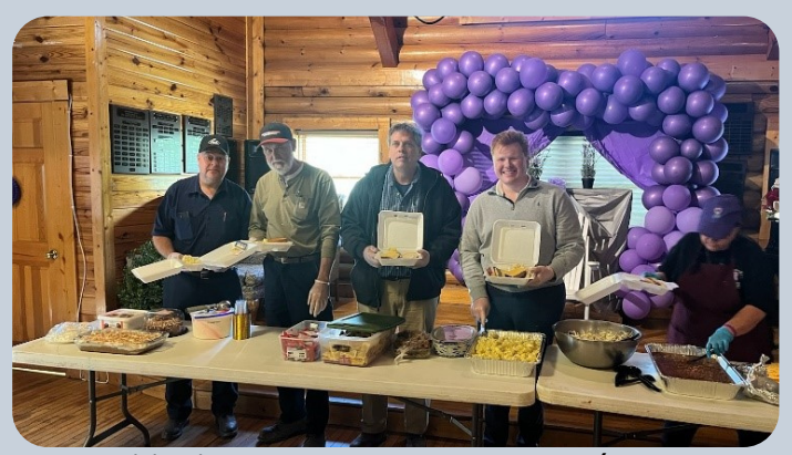
Local Officials in Perry Co served lunch to Hazard/Perry Co Senior Citizens

Lunches for Leaders were held in all Senior Citizen Centers during May 2023. The goal of Lunches for Leaders is to help create awareness of the importance of the senior meal program in our area. County elected officials were present at events held throughout the Kentucky River Region.