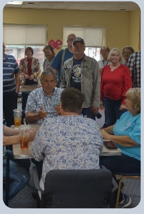
Breathitt Senior Citizens doing activities during Thursday Night out at the Breathitt Senior Center

During FY 23, the Kentucky River Aging Programs offered Thursday Night Out meals to senior citizens in Letcher, Lee, and Breathitt Counties. Senior Citizens aged 60+ were able to receive a voucher for meals offered on Thursday Nights. The meals were offered in Lee County at the Lee County Farmer's Market, Letcher County at the City of Whitesburg Farmer's Market, and Breathitt County Farmer's Market.